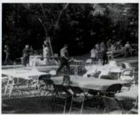
Volunteers make ready for PerLop dinner