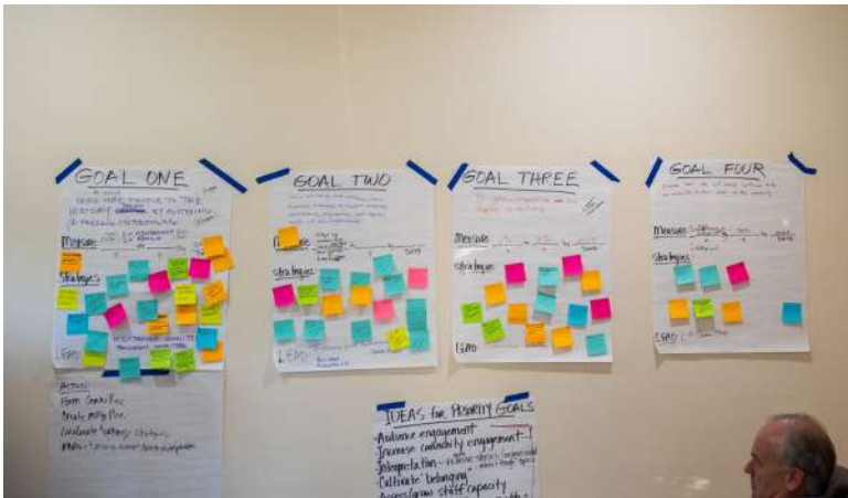
Above: Board and staff identified the four primary goals and brainstormed strategies to fulfil those goals using sticky notes.

The Thomasville History Center enriches the community through the exploration and discovery of its history, people, and stories.