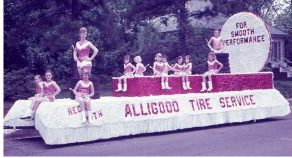
Rose Festival Parade, 1967

The Thomasville History Center is returning to the Rose Show and Festival as the subject of our next Do You Remember? conversation. The next edition will occur on Thursday, April 23 at 10am. This special day-time Do You Remember? will compliment the community's slate of events for the 99th Annual Rose Show and Festival.