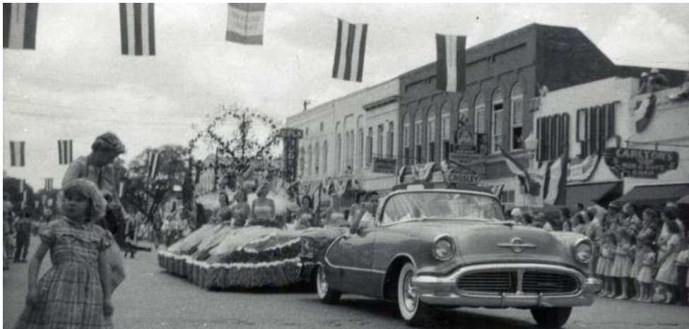
Rose Festival Parade, 1957