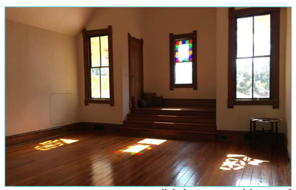
A SALUTE TO SPRING Tuesday, March 20, 2018 3:30pm-5:30pm

Flowers are blooming, days are longer, and it's time for a celebration! All ages are invited to join us at the Lapham-Patterson House for a special weekday edition of Make History on Tuesday, March 20th for A Salute to Spring . March 20th is the vernal equinox, a day marking the start of spring and a day in which there are equal day and night hours. On this day each year, a unique phenomenon occurs on the third floor of the Lapham-Patterson House.