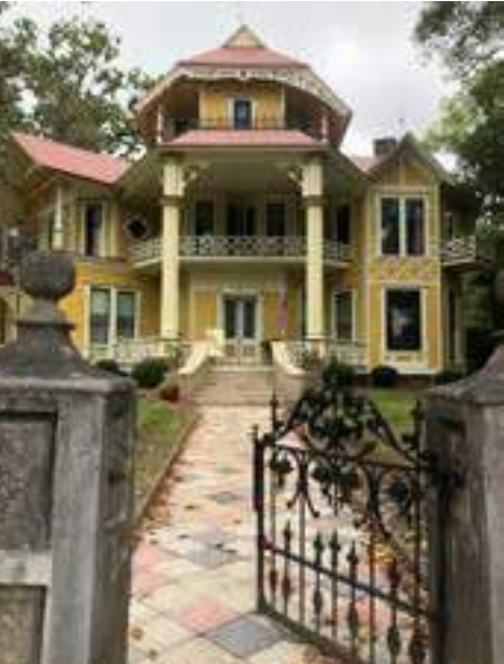
Peering Into the Possibilities: An Illuminating Evening at the Lapham-Patterson House Saturday, October 19, 2019 6pm Cocktails, 7:30pm Dinner 626 N. Dawson St.

In 2019, the History Center and the Department of Natural Resources agreed to an extension of this agreement for another five years. In addition, the History Center continues to pursue the National Treasures designation on behalf of the Lapham-Patterson House.