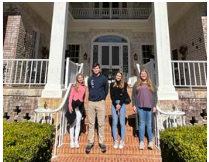
Some of our wonderful Apprentices at Pebble Hill Plantation in January.