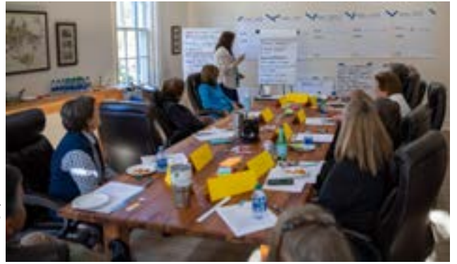
History Center Board and staff attended a retreat in January 2020 to draft the current strategic plan.

As you will remember, the History Center was accepted into the MAP or Museum Assessment Program in 2021. MAP is a joint venture between the American Alliance of Museums (AAM) and the Institute for Museum & Library Sciences (IMLS) that helps institutions to do a great deal of self-reflection and discussion and provides a peer reviewer to visit each program site and offer their suggestions for moving forward.