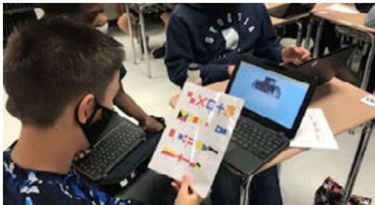
8th graders at Thomas County Middle School playing the 8th grade Deep Dive game about the Civil War in fall 2020. Students had to complete challenges to "escape" Andersonville Prison.

Tips: Read the questions carefully and have the associated materials printed or pulled up digitally. Some links will be embedded in the Google Form itself. If you enter an incorrect answer, you cannot advance until the correct answer is entered. A complete how-to guide is included in the folder but be warned, it contains all the answers! Stop reading the instructions after the first couple of pages if you want to have the real student experience!