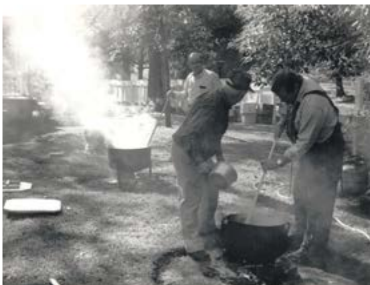
The first Pilau dinner at the Thomasville History Center, 1993