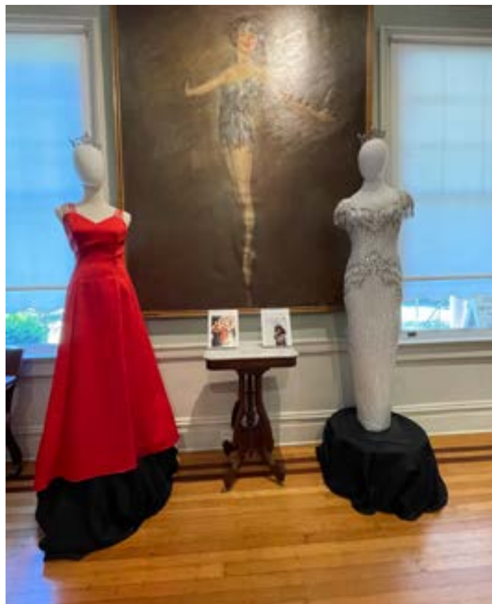
Gowns and crowns of former Miss Thomasville's on display in April 2021 for the centennial Rose Show & Festival

We are also always actively collecting photographs, objects, home videos, etc. of the Rose Show and Festival for our collections. We have a great deal of photograph and film footage from the 1950s and 1960s, but would love to see what you have from the 1970s and beyond. We are also accepting gowns from past Thomasville Rose Queens and Miss Thomasville's. We are grateful to those who have entrusted the long-term care and keeping of your Rose Show memories to us.