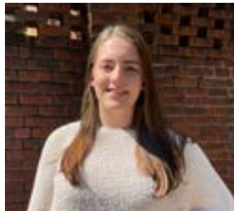
Maggie Claire Richardson Scholars Academy